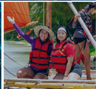
RULES, REGULATIONS, & SAFETY