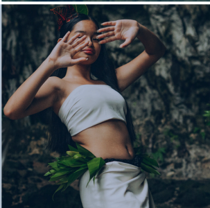
HISTORY & CULTURE